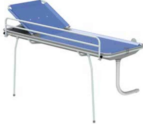
6300 4040 / 6300 4045 Amfora Shower stretcher wall mounted, hinged