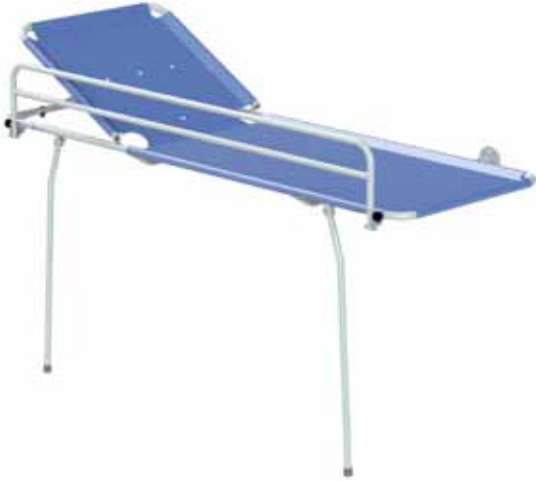
6300 4030 / 6300 4035 Amfora Shower stretcher wall mounted, hinged