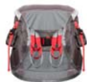
ThoraxSling, with seat support