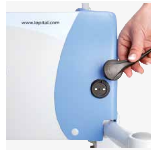
Charging point with magnetic coupling.