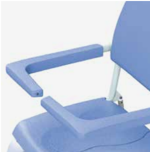
Independent, foldable upholstered armrests with front lock.