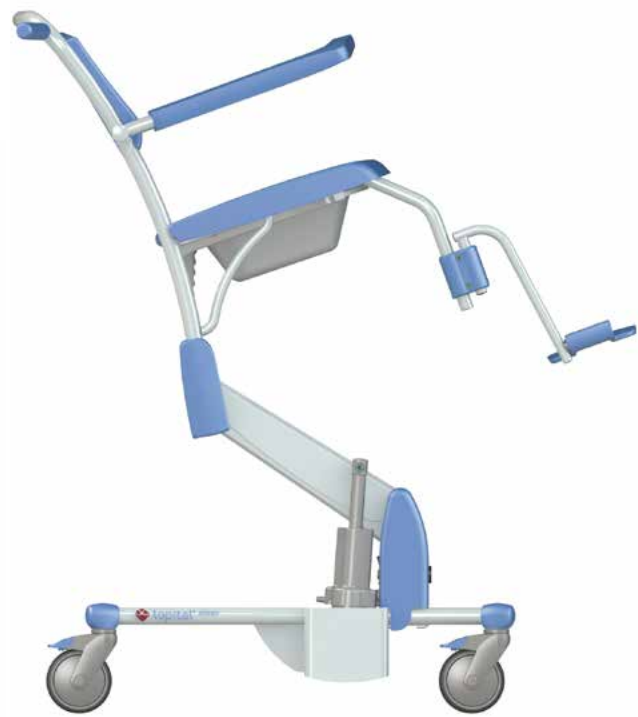
Tilt setting to 20 degrees.