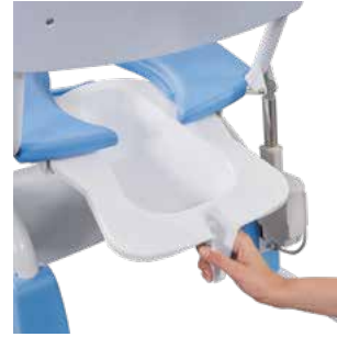
Option: Product no. 6950 1104 Plastic bedpan and lid.