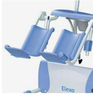
Option: Product no. 6960 8026 Adjustable comfort leg supports.