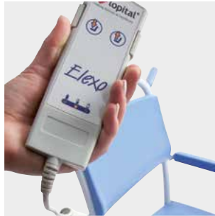
Hand control with battery indicator.