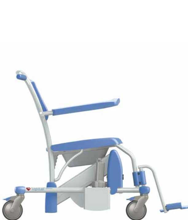
Seat height in lowest position 50 cm.