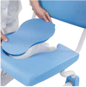
Ergonomically formed seat with inlay.

Suitable for people with a mild to severe disability