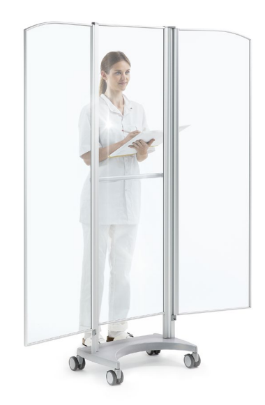
Height 6'1", Width 4'11"

When using ClearPanels staff will not have to use visors. Both staff and patients remain protected while maintaining contact and distancing. Please note: The short side ClearPanels seen in the photo to the left is a special solution made for Herlev Hospital. It is not a standard Silentia ClearPanels screen.