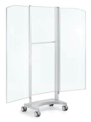
Height 5'1", Width 4'11"