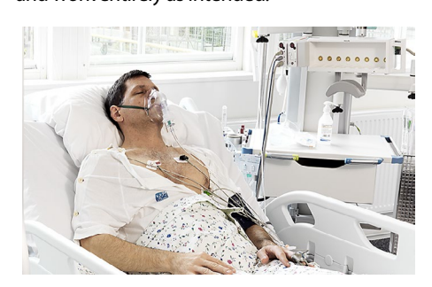
Transparent screens for different healthcare settings such as monitoring with distance in emergency room and intensive care units.

A follow-up review of the solution shows that the staff appreciate the new solution. The screens are used daily with all patients and work entirely as intended.